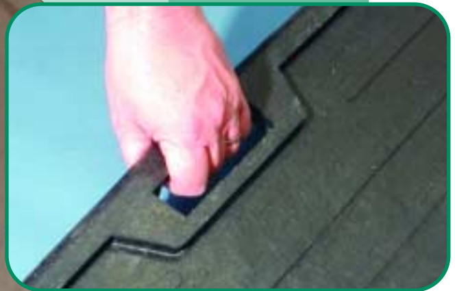
Molded Handles in 44- x 70-inch Model