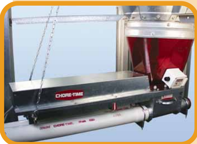
Automatic Boot Slide Actuator System

Chore-Time's innovative new automatic and manual feed bin boot slide actuators allow poultry and livestock producers to easily operate their bin's boot shut-off slide. Both versions can be used on straight-out or 30-degree (incline angle) boots and feature a reliable design that provides simple, trouble-free operation.