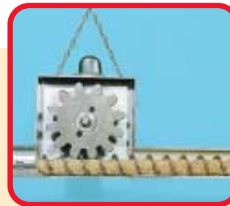
MULTIFLO® Drive Gear