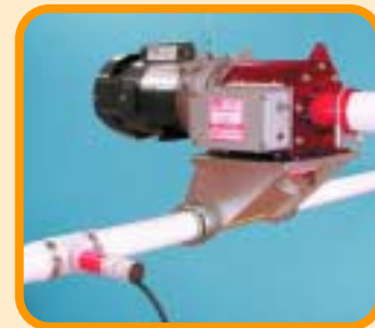
Feed Level Control