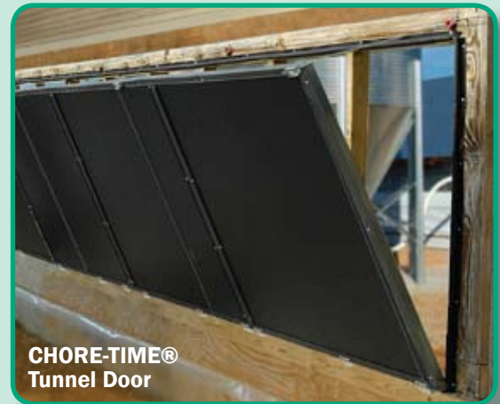
CHORE-TIME® Tunnel Door