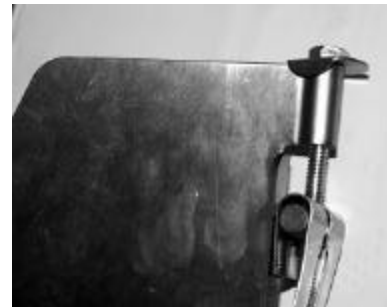
Step 6. When Tightening the Bolt the