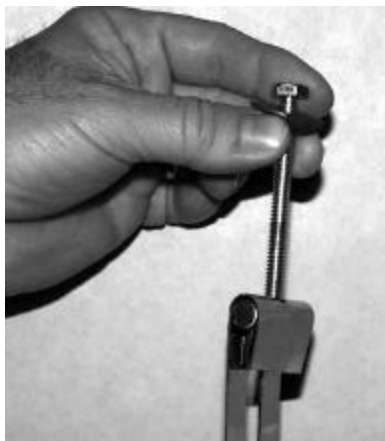
Step 3. Pull Bolt Assembly up into the