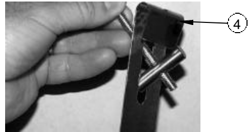
Step 2. Slide Bolt, Washer, and Nut