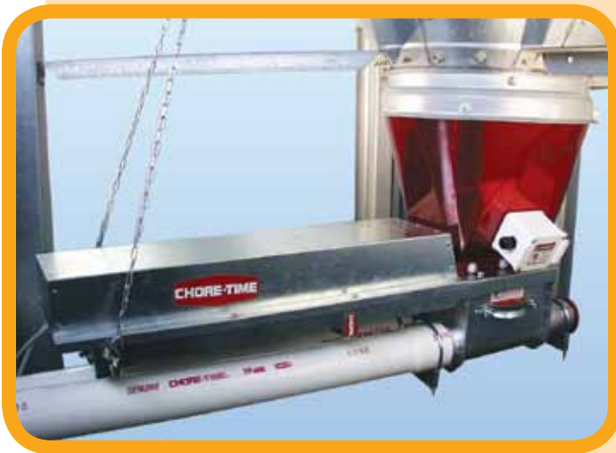
Automatic Boot Slide Actuator System

The innovative CHORE-TIME® automatic and manual feed bin boot slide actuators allow pig producers to easily operate their bin's boot shut-off slide. Both versions can be used on straight-out or 30-degree (incline angle) boots and feature a reliable design that provides simple, trouble-free operation.