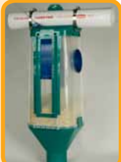
PIGTEK® DOSFLOW™ Sow Feed Dispenser