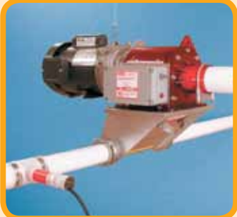
Feed Level Control