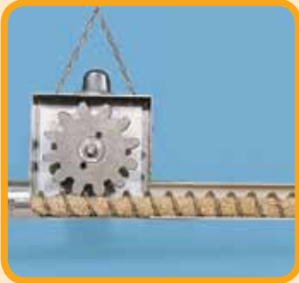
MULTIFLO® Drive Gear