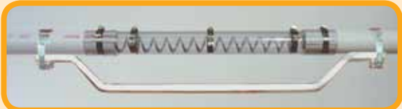
MULTIFLO® Inspection Window