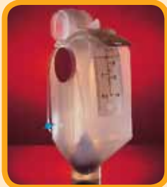
CHORE-TIME® Portion Control Feeder