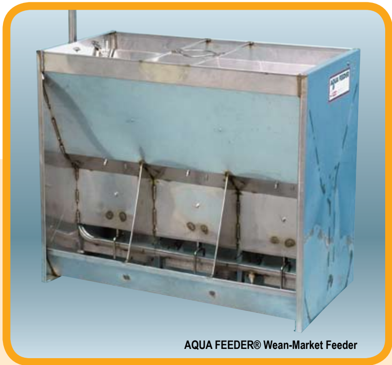
AQUA FEEDER® Wean-Market Feeder