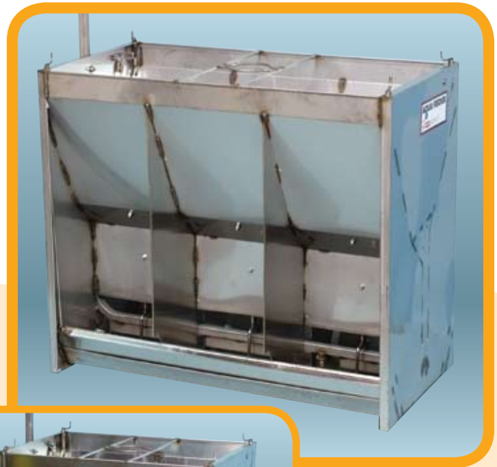
AQUA FEEDER® Wean-Market Feeder with Adjustable Feed Saver Lip