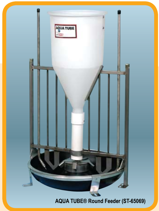
AQUA TUBE® Round Feeder (ST-65069)

For the distributor nearest you, call the PigTek Customer Fulfillment Department at 800-341-1039 or use the Distributor Finder on www.PigTekAmericas.com .