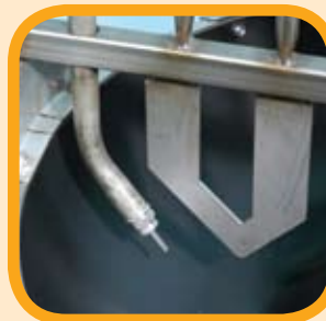
Easy drinker nipple access