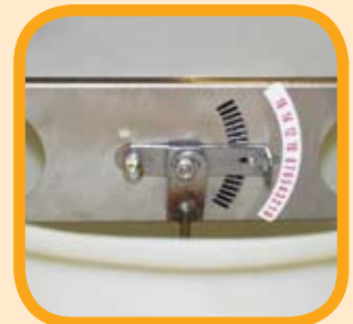
Precise feeder adjustment