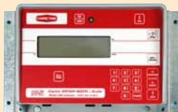
Model 200 Indicator