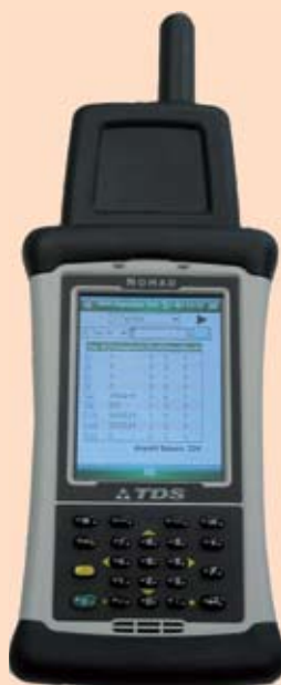
Multi-functional MILAN NOMAD pocket computer