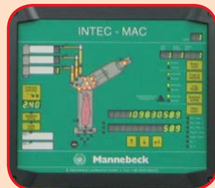
The MAC INTEC Feed Station Controller allows pig producers to directly access all feed station functions through the simple-to- operate visual interface.