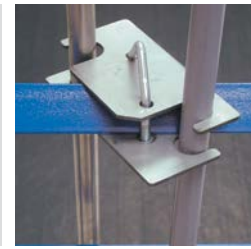
< Pipe Bracket