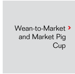
Wean-to-Market > and Market Pig Cup