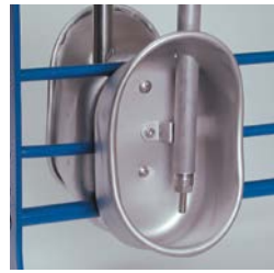
< Nursery Cup