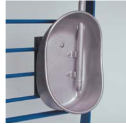
Universal Stainless > Steel Backing Plate used to mount cups