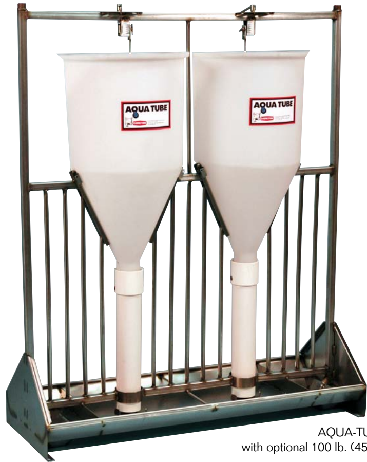
AQUA-TUBE® Feeder with optional 100 lb. (45 kg) hoppers