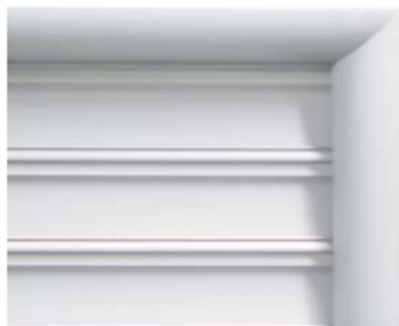
“Belled” style louver shutter frame has a curved aerodynamic shape for greater air-moving efficiency.