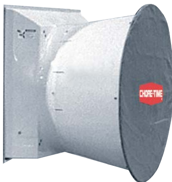
Optional cone covers help to seal out drafts and are made of vinyl-coated, ultraviolet-resistant fabric.