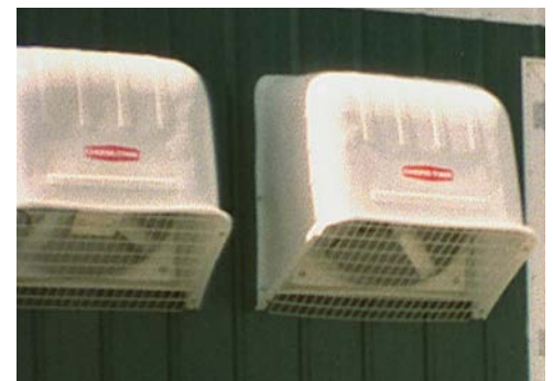
Optional weather hood for 24-inch (610-mm) fans.