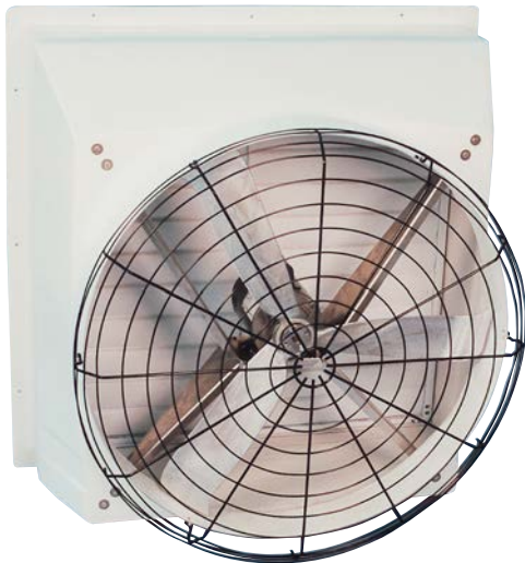
Chore-Time TURBO® Fan with grill.