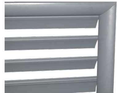
Flexible louver edge helps seal the fan's opening when the fan is not operating.