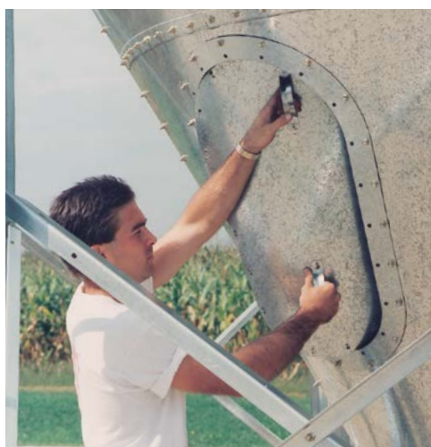
SIMPLE-TO-REMOVE ACCESS DOOR