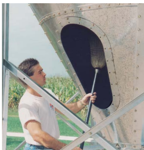
EASY GROUND-LEVEL BIN CLEAN-OUT